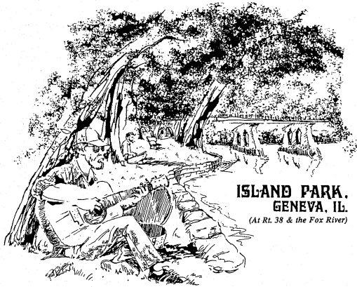
ISLAND PARK. GENEVA, IL. (At Rt. 38 & the Fox River)

At Island Park, Geneva, IL September 4 & 5, 2011